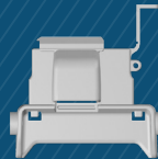
IC Ex15-Elster BK, IC Lx15 -Landis&Gyr model 750,1010