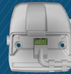
IC Ux15-for diaphragm/rotary gas meter equipped with pulse output or cable