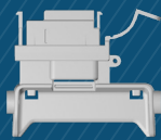
IC Mx15-Metrix GL