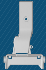
IC Kx15-Kale Kalip