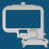
IC Rx15-Itron RF1

OKO XM05 installed on gas meter takes pulses from the meter (appropriate adapter on request - see below) and can send the data over a wide variety of mobile networks to acquisition server. Subsequently, the data can be processed further to 3rd party data center.