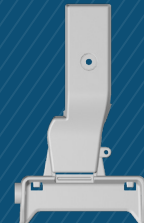
IC Kx15-Kale Kalip