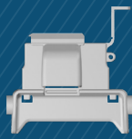
IC Ex15-Elster BK, IC Lx15 -Landis&Gyr model 750,1010