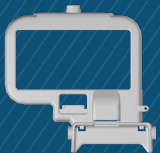
IC Rx15-Itron RF1

OKO x4A5 installed on gas meter takes pulses from the meter (appropriate adapter on request - see below) and can send the data over NB-IoT network to an acquisition server. Subsequently, the data can be processed further to 3rd party data center.