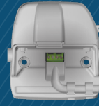
IC Ux15-for diaphragm/ rotary gas meter equipped with pulse output or cable