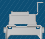
IC L013-Landis&Gyr model 750,1010

▪ All adapters are available in version with replicated pulse output